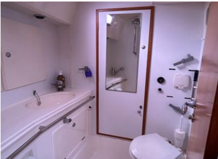
STANDARD INTERIOR LAYOUT